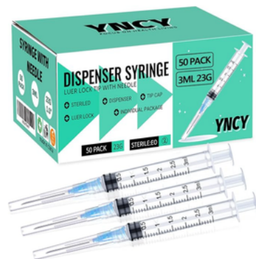
50 Pack 3ml Disposable Syringe